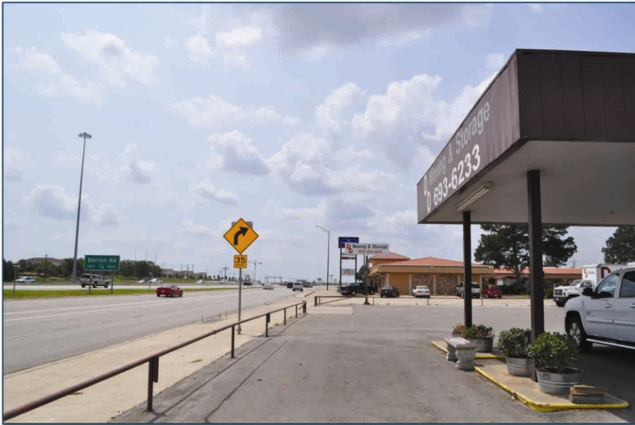
Looking South Along SH-6