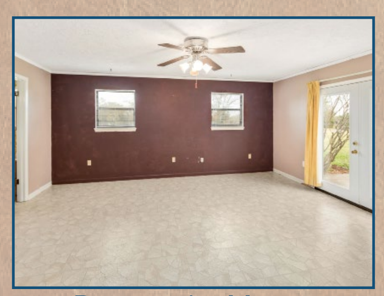
Downstairs Master Bedroom