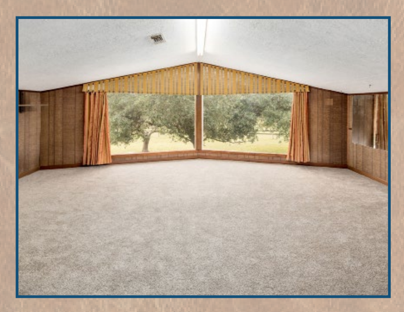
Upstairs Game room