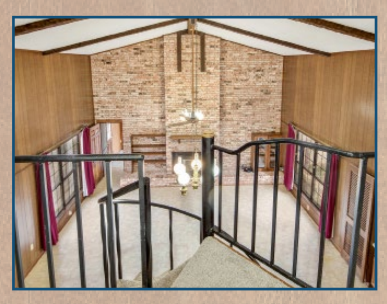
Upstairs overlooking living room