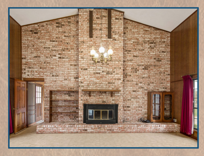
Fireplace in Living room