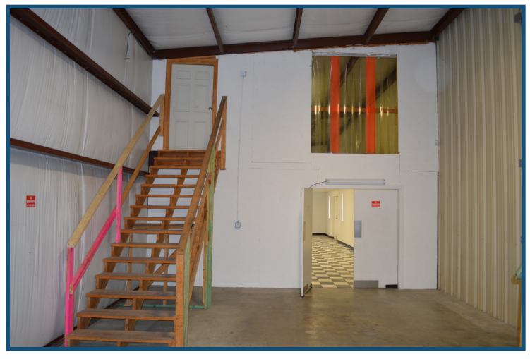
View towards Showroom