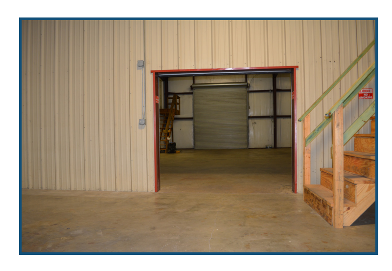
OH Door Between Halves