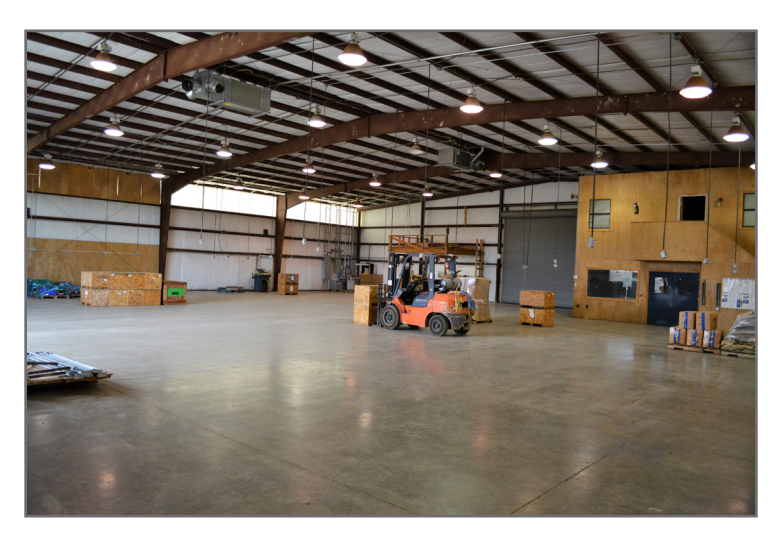
Warehouse, View Rear to Front