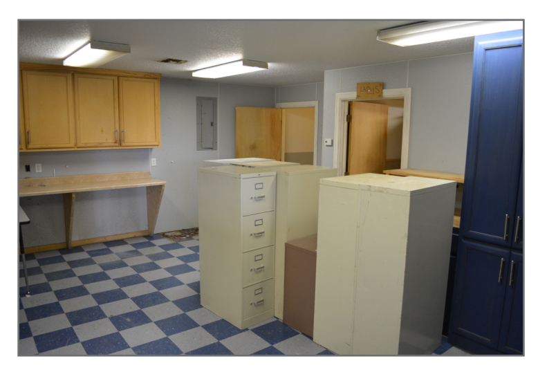
1st Floor Office