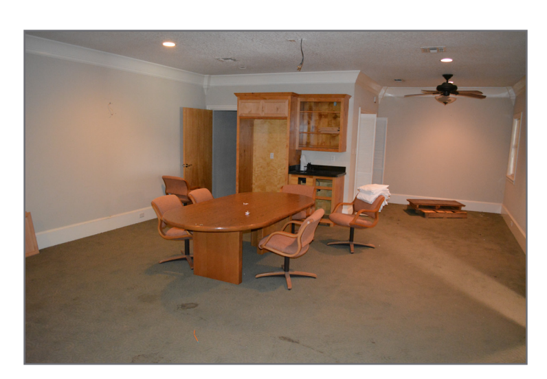
2nd Floor Office