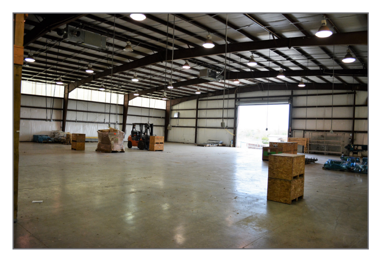
Warehouse, View Front to Rear