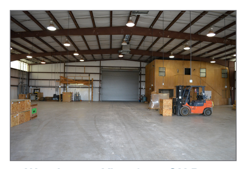
Warehouse, View from OH Door to Front