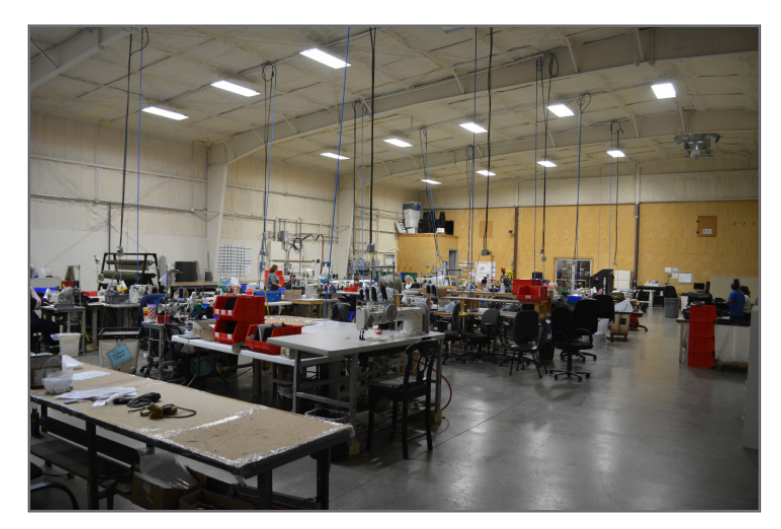
Warehouse, View Rear to Office