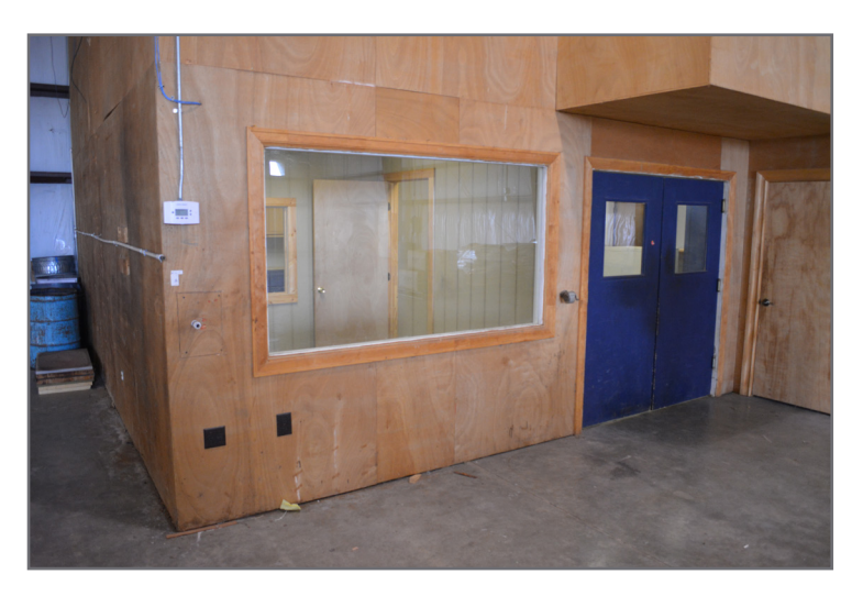
1st Floor Office