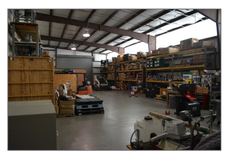
Warehouse, View Rear to Front

100'x 100' clear span builing has dividing wall down the center. One half is climate controlled. This wall can be removed, easily, if needed.