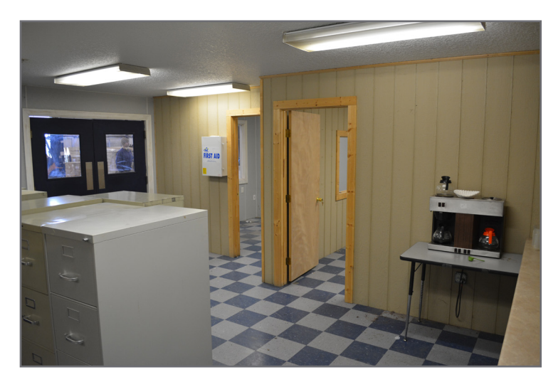
1st Floor Office