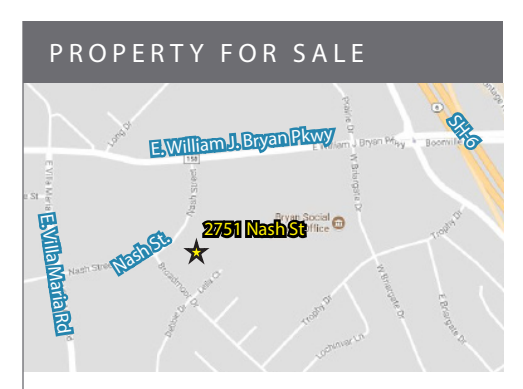
Offered for Sale: