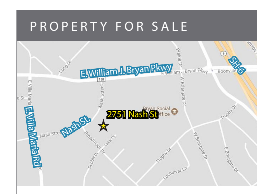
Offered for Sale: