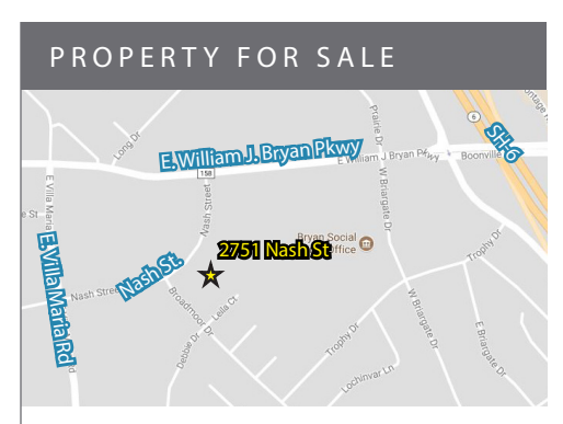
Offered for Sale: