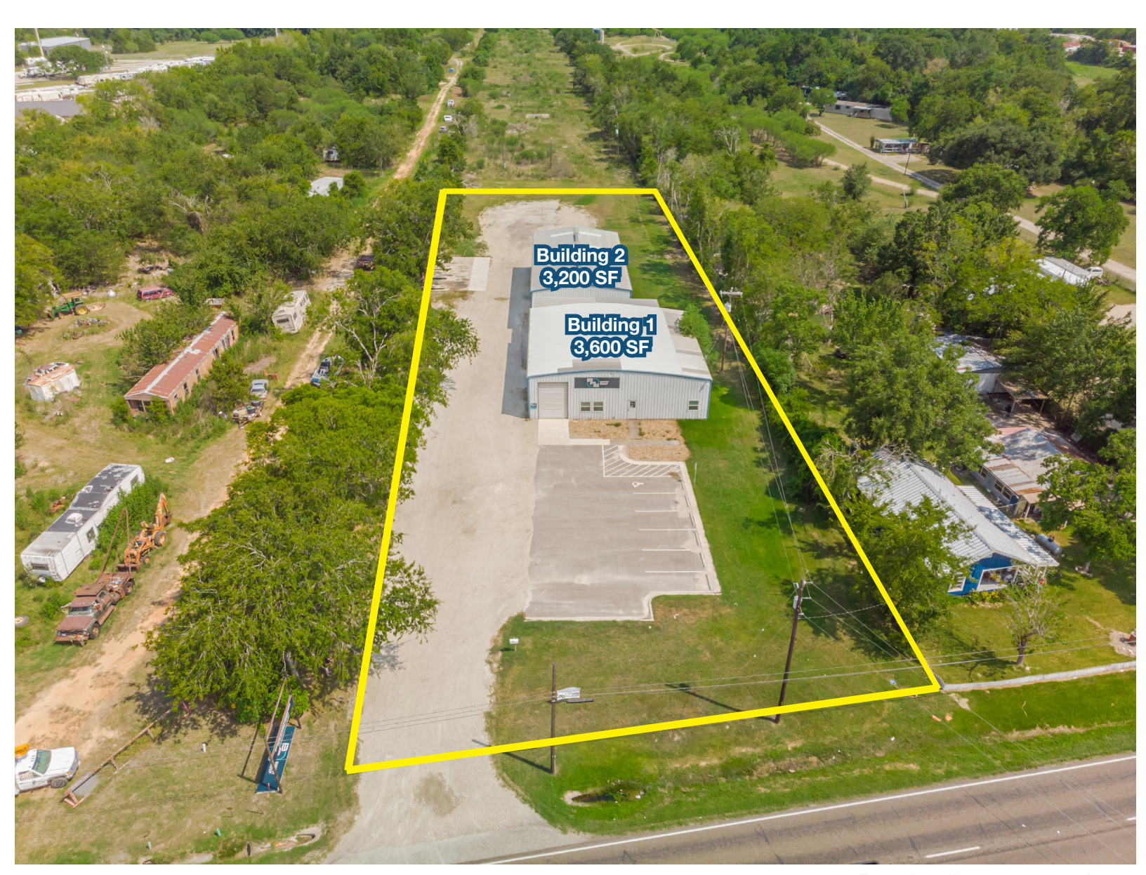
Boundary lines are approximate