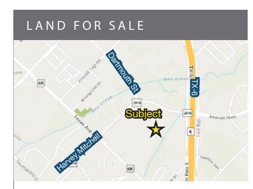
Offered for Sale: $2,505,789