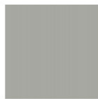
P-1 - PAINT COLOR: SW 7066 GRAY MATTERS