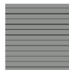
M-2 - PAC CLAD WALL PANEL : BOX RIB 1 PROFILE SLATE GRAY FINISH