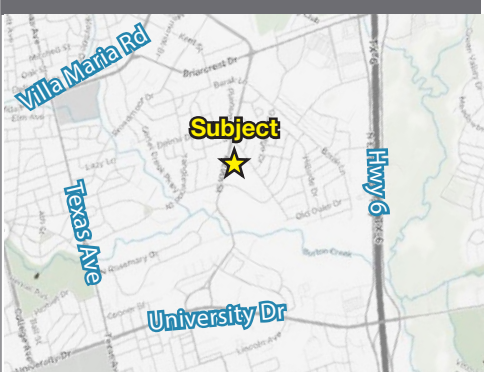
Suite: 82 Size: 3,575 SF Price: $4,250/MO NNN 2020 NNN's estimated at $823.69

Premier space in the center with excellent visability from 29th street!