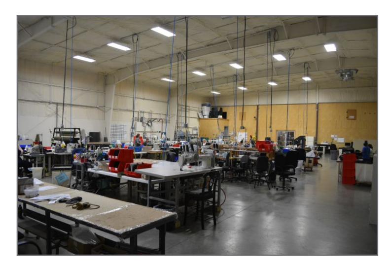
Warehouse, View Rear to Office