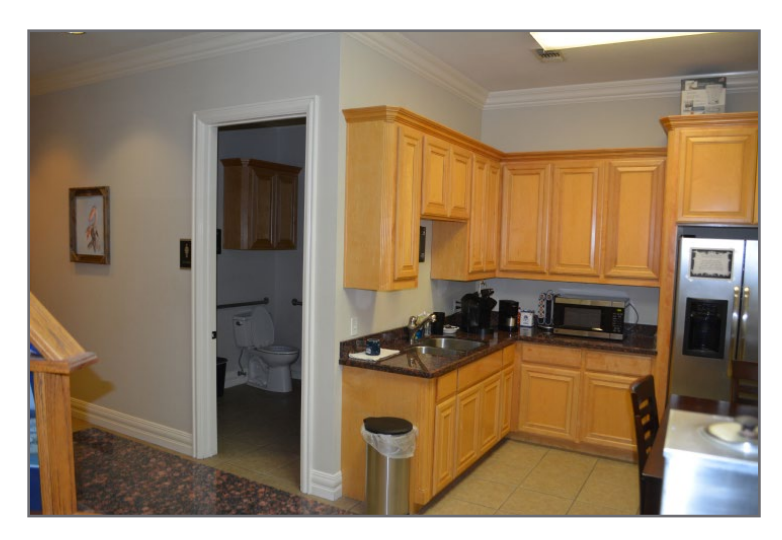
Restroom & Breakroom