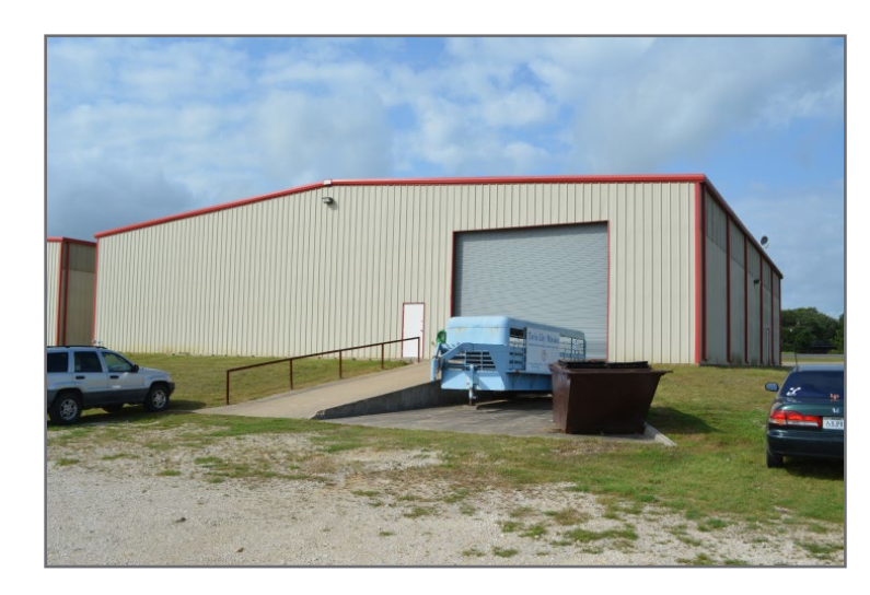
Rear View, Dock high and grade level entry