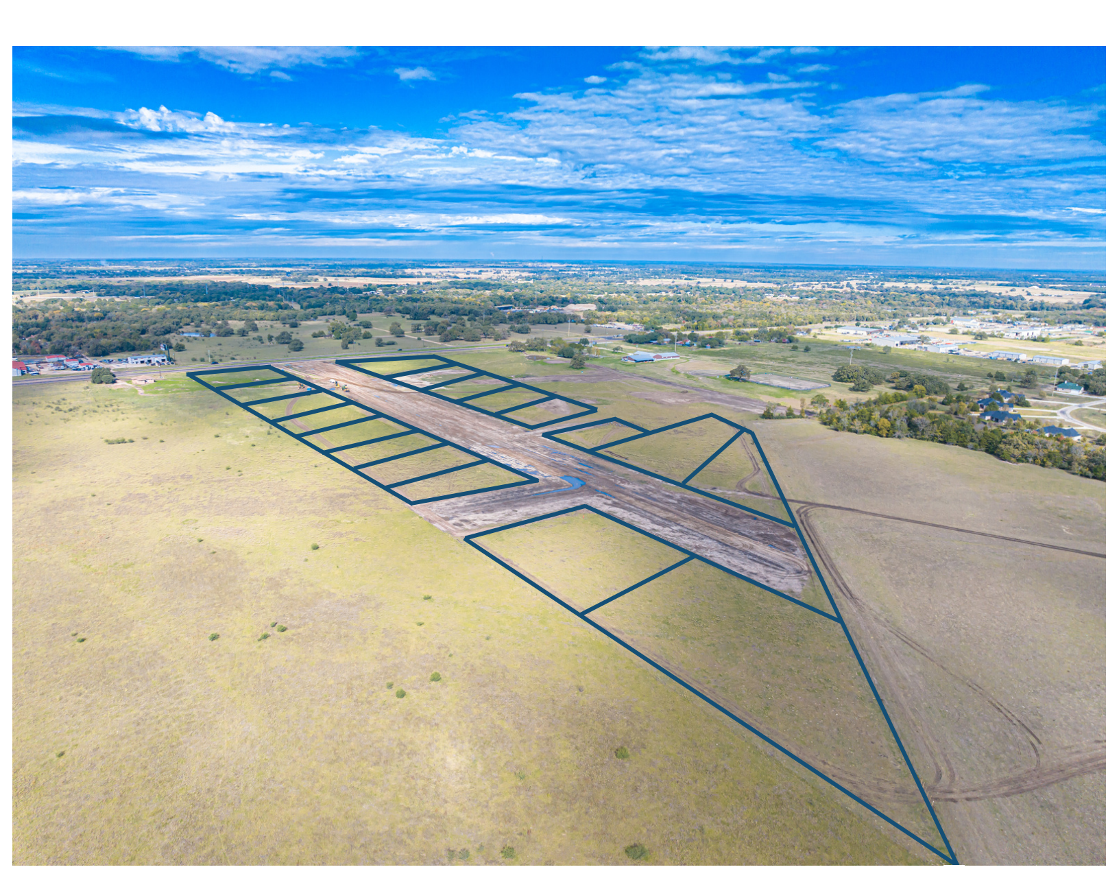
*All boundary lines are approximate