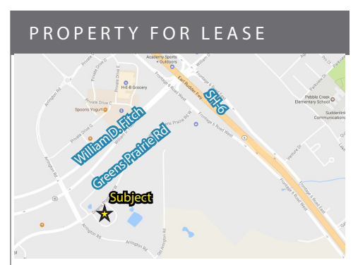
Offered for Lease: Office 8 - $750/MO Gross Office 10 - $450/MO Gross