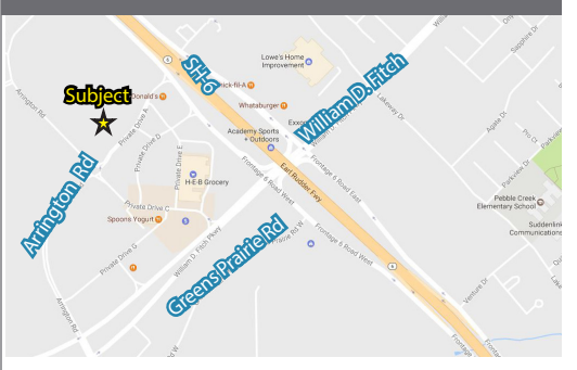
Shell Buildings Offered for Sale: $450,000 - $490,000

Suitable for all businesses! Custom finish out your shell for office, retail, or restaurant!