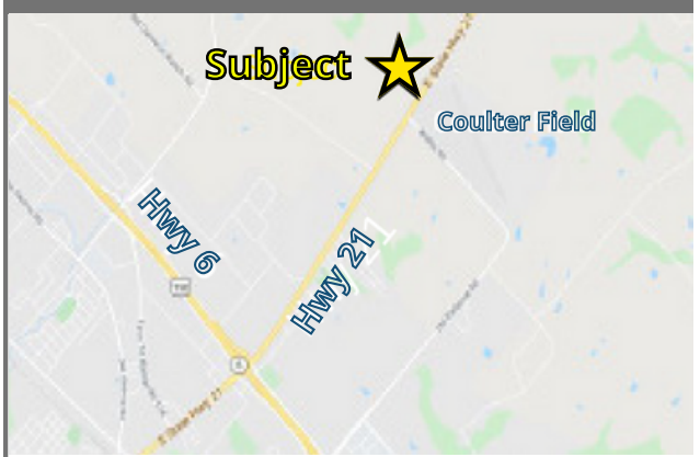
Available Units: Suite: 1513 Size: 2,400 SF Price: $2,300/MO Suite: 1519A Size: 1333 SF Price: $1,350/MO Industrial Gross

Clark Isenhour Real Estate Services, LLC 3828 S College Ave Bryan, Texas 77801 www.clarkisenhour.com No warranty or representation, expressed or implied is made as to the accuracy of the information contained herein, and same is submitted to errors, omissions, change of price, rental or other conditions, withdrawal without notice, and to any special listing conditions imposed by the owner