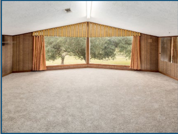
Upstairs Game room