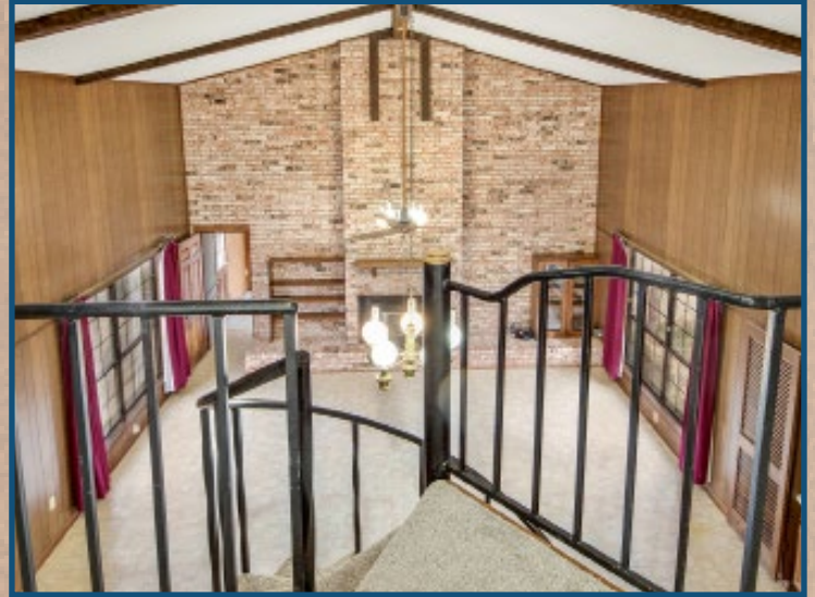
Upstairs overlooking living room