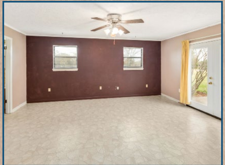
Downstairs Master Bedroom