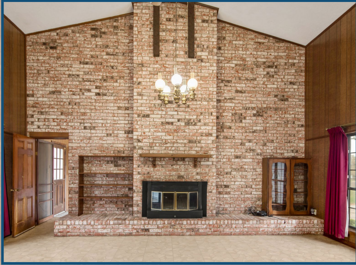
Fireplace in Living room