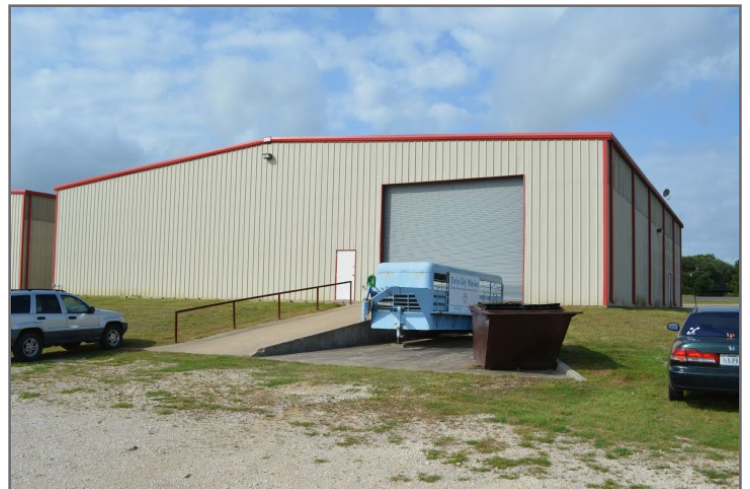
Rear View, Dock high and grade level entry