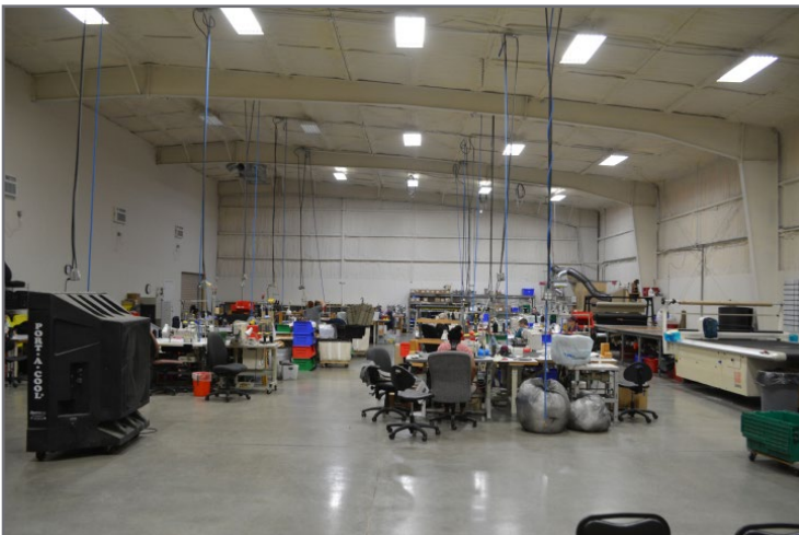
Warehouse, View Office to Rear

100' x 100' clear span building has dividing wall down the center. One half is climate controlled. This wall can be removed, easily, for longterm tenant if needed.