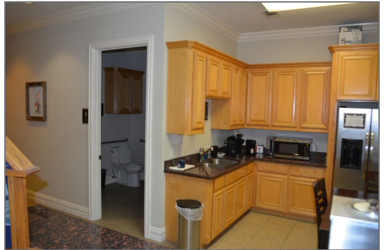
Restroom & Breakroom