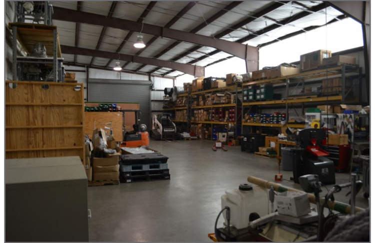
Warehouse, View Rear to Front

100' x 100' clear span building has dividing wall down the center. One half is climate controlled. This wall can be removed, easily, for longterm tenant if needed.