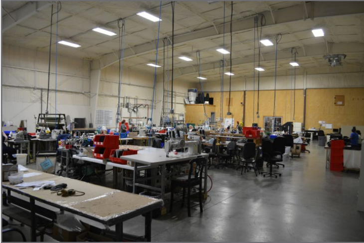
Warehouse, View Rear to Office