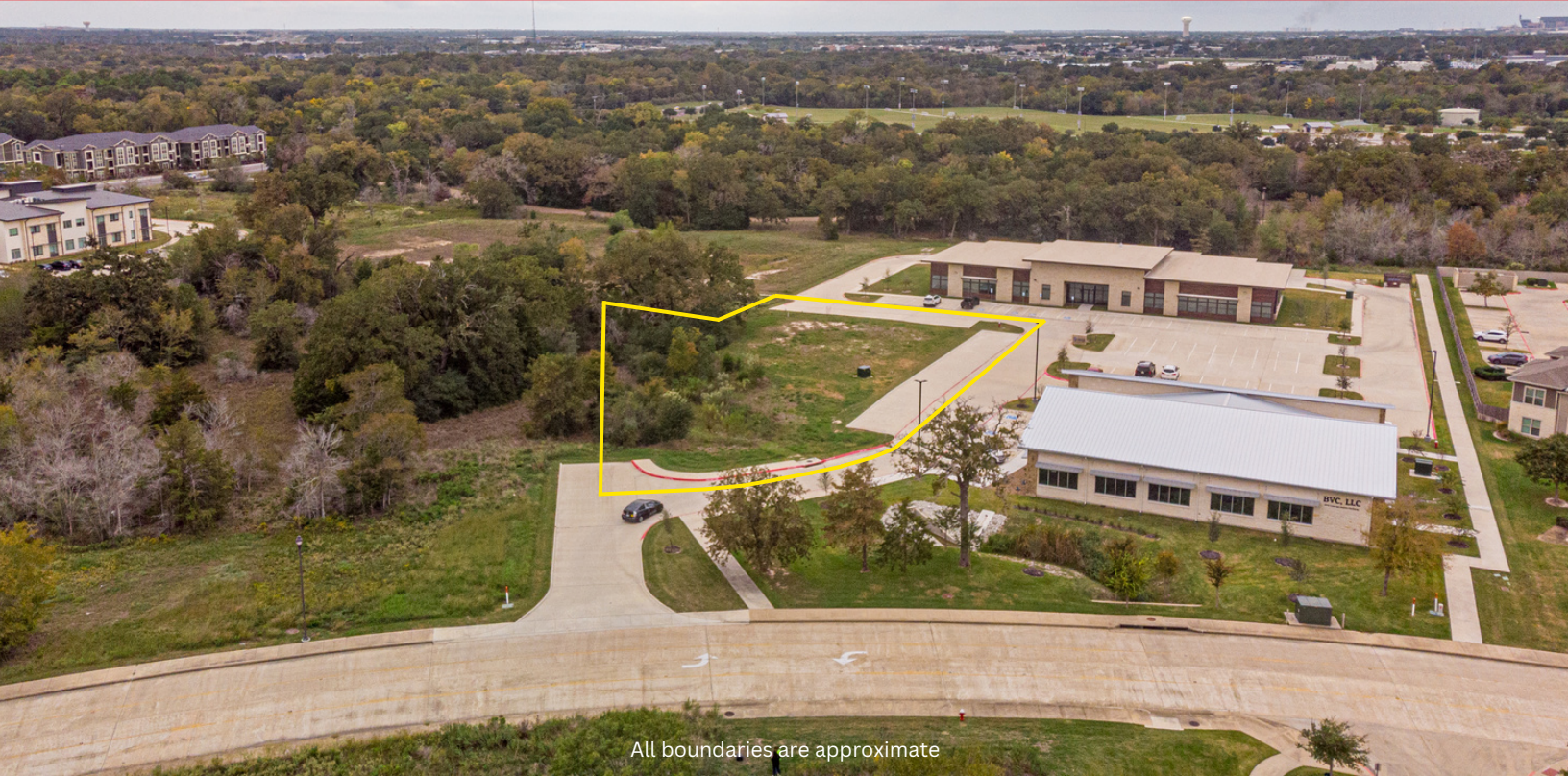
All boundaries are approximate