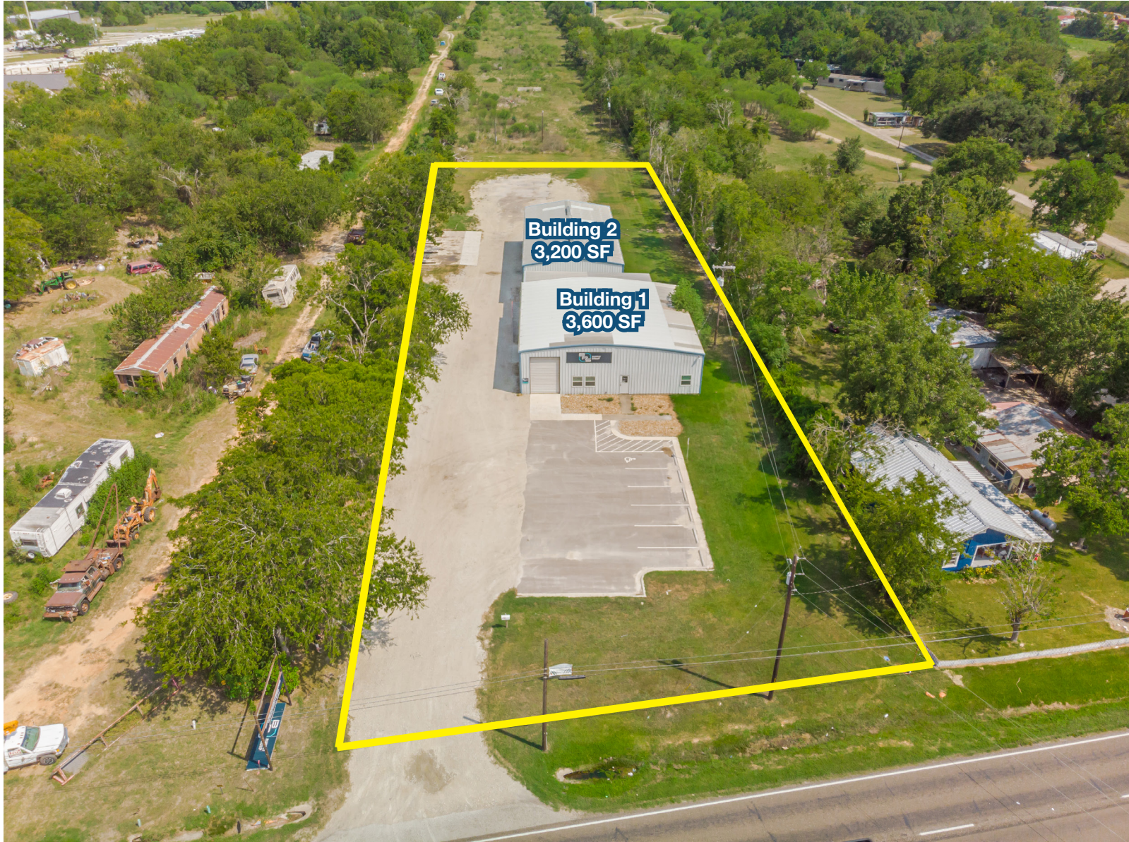
Boundary lines are approximate