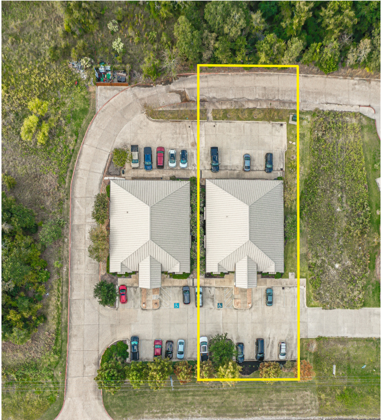
Property lines are approximate