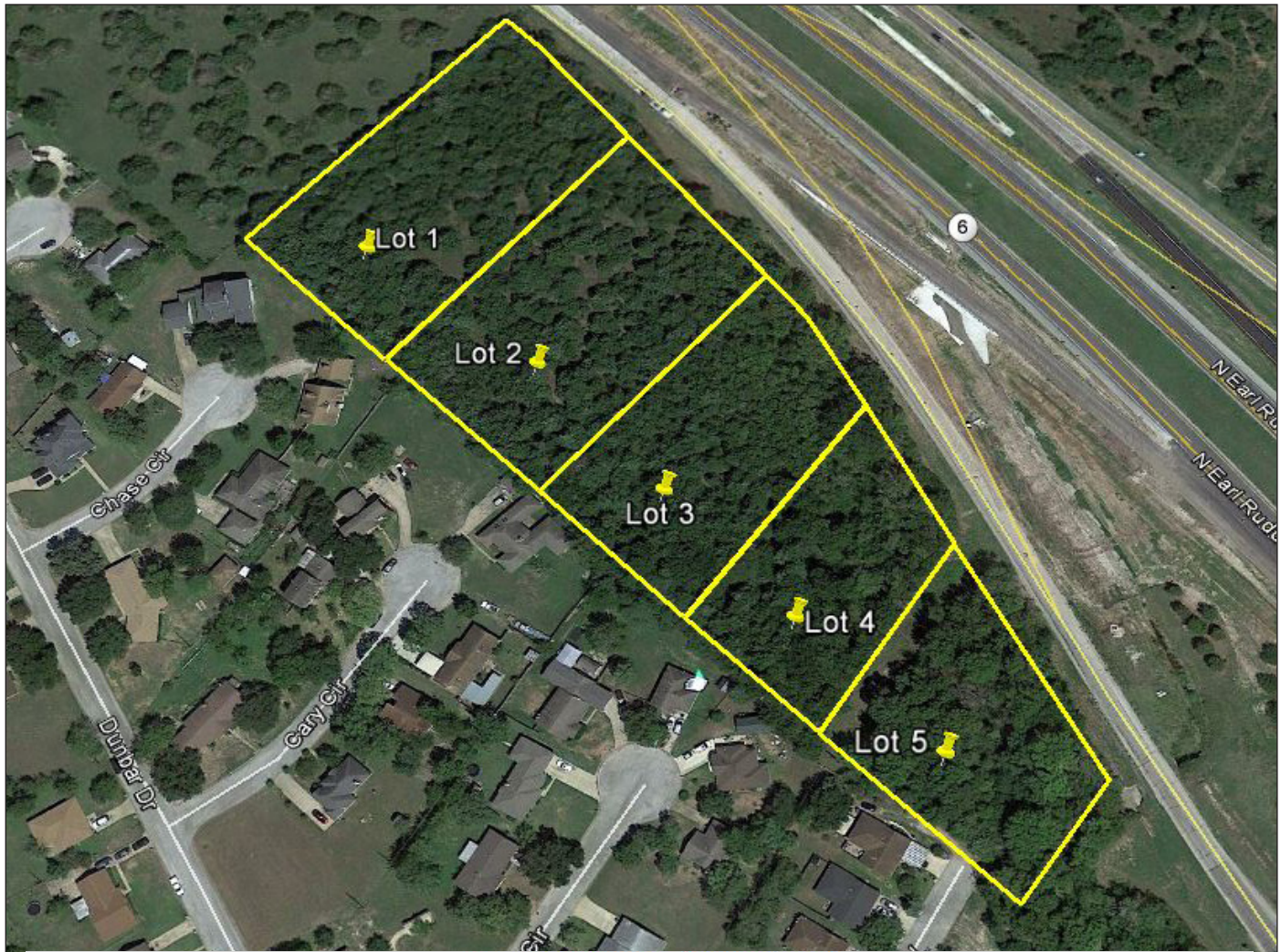
Lot Measurements (Approximate)