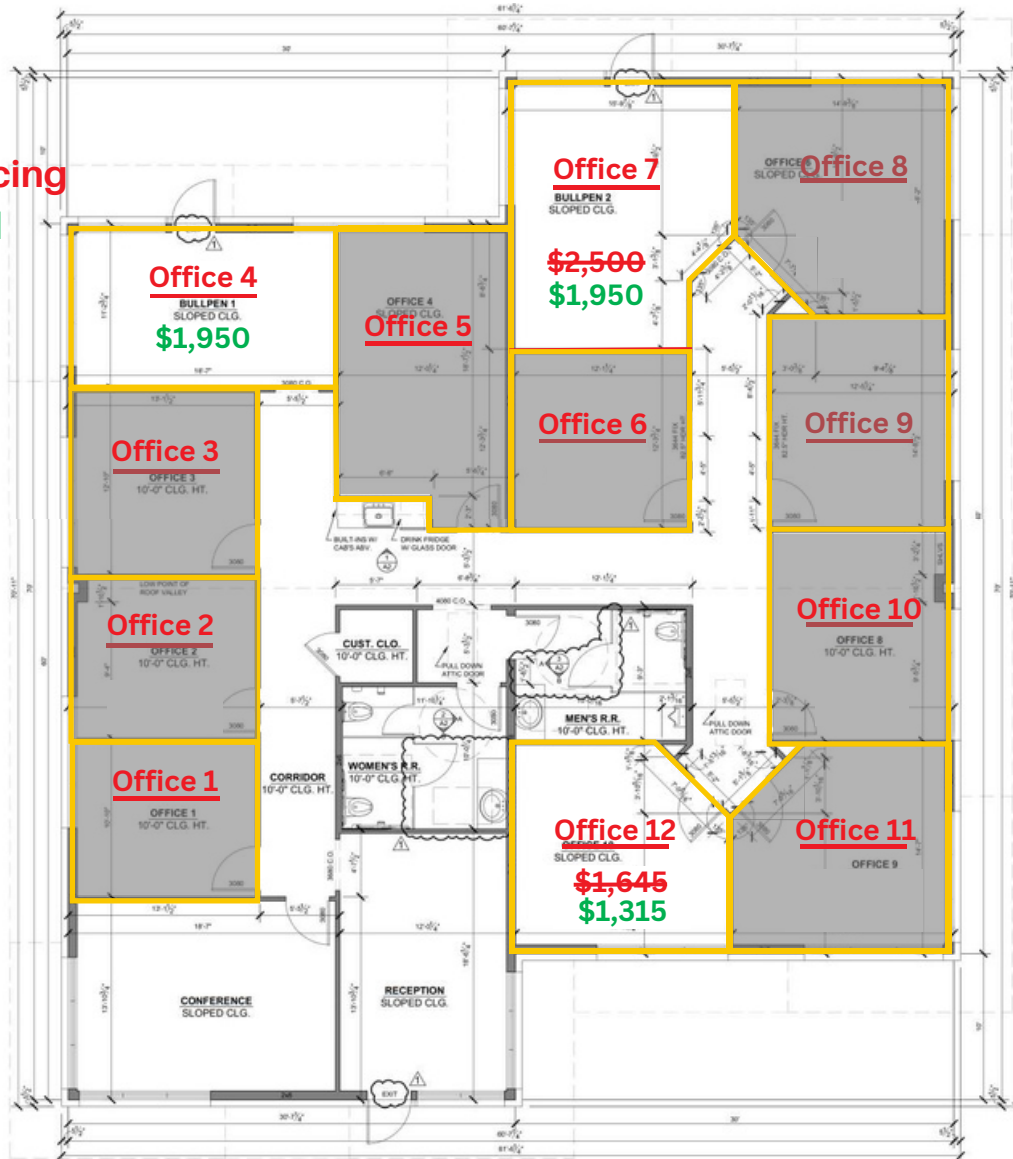
1 FIRST FLOOR PLAN 1/4" = 1'-0"